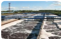
Infraestructura de Tratamiento