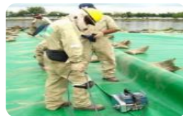
Gestión del servicio de Tratamiento de